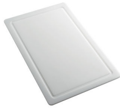
PLANCHE DE DECOUPE HDPE 27x42 CM A657 F01