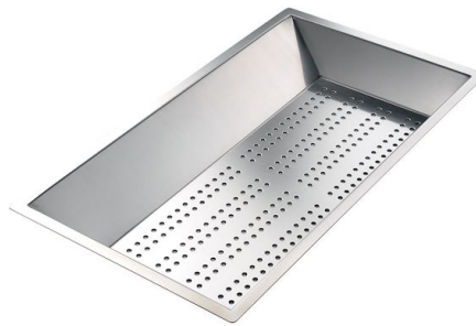
CUVETTE PERFOREE POUR EVIERS RIVA

* only in combination with the accessory A644 F04