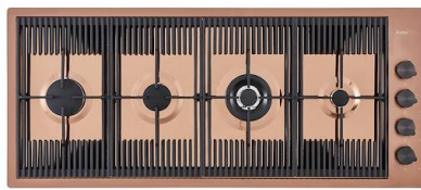
MILANO 4 BRULEURS COPPER G681 F08